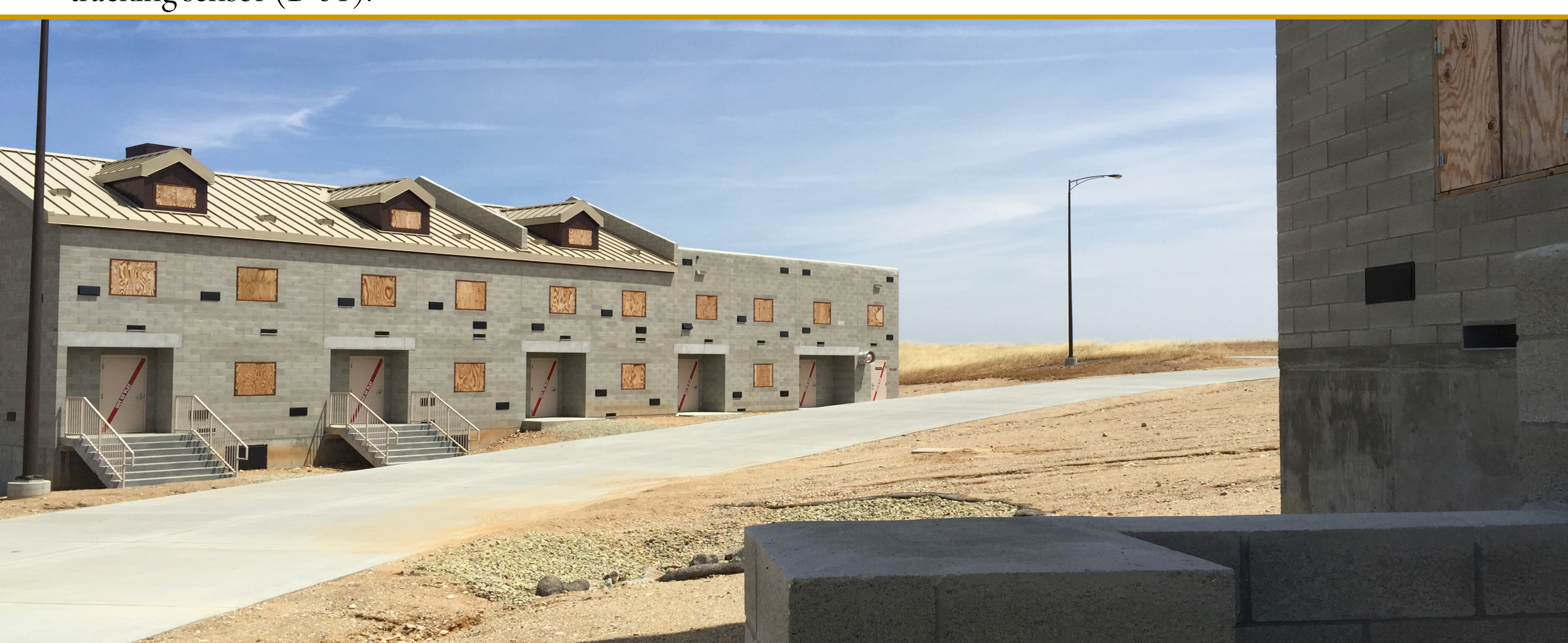
CATF Area: A mock village with several buildings to use during integrated scenario testing. Here, a picture of the Hotel; To the right: (a) underground tunnel network passage; (b) Church building